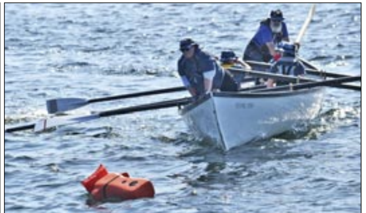
Harbor Seal Team 6, participating in the 2025 Wicked Whaleboat Challenge, maneuvers to the person overboard dummy (BOB) after having tossed it overboard at an earlier marker so the bow rower can recover it and race to the finish line.

With its blend of competition, tradition, and lighthearted fun, the Wicked Whaleboat Challenge promises an exciting day on the water for participants and spectators alike. Admission for spectators is free, making it an ideal outing for families, locals, and visitors looking to experience New Bedford's rich maritime culture firsthand.