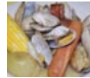
Clam Boils are BACK! Free cup of chowder

FREE CHOWDER WITH FISH & CHIP LARGE & EXTRA LARGE 10 % REWARDS + $5 SIGN UP BONUS