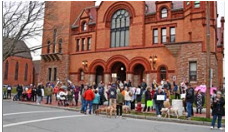
Protesters gather in front of Fairhaven Town Hall on 3/30/26 before the Select Board meeting to protest the proposed closing of the animal shelter due to budget constraints.

The other is the Acushnet Schools tuition agreement. The town is currently in negotiations with Acushnet, but they made a deal with Old Rochester Regional and New Bedford. It is unclear if they will renew the contract with Fairhaven, but in any case, Acushnet students now have ORR as an option, so