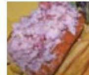
Lobster Roll with FREE chowder