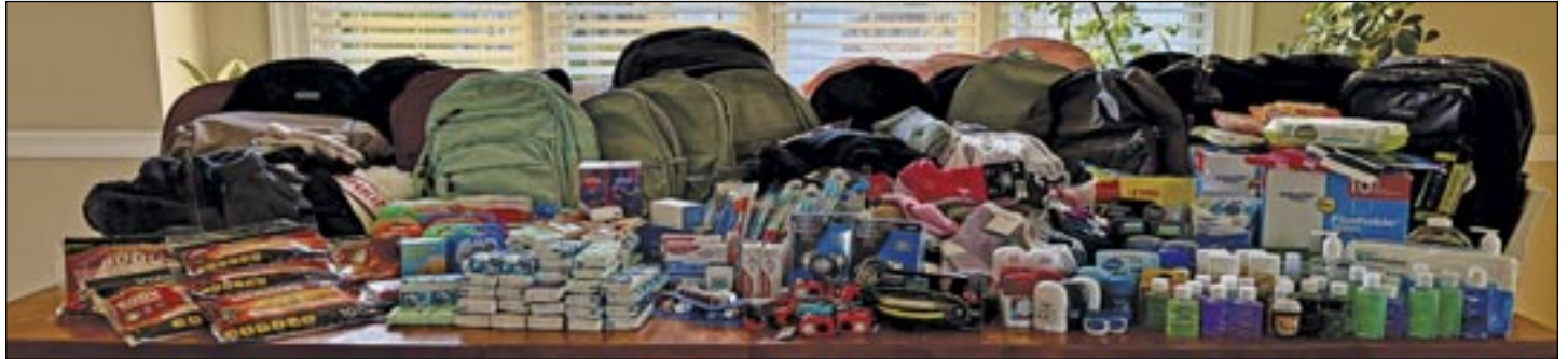
Students of the Fairhaven High School Honor Society collected an abundance of items for distribution to local homeless people, including 28 backpacks and many personal care items.

The mission of Works 4 U, Inc. is to end homelessness through employment. It has helped hundreds of local people experiencing homelessness over the past five years that it has been in operation. This year alone, over 120 people benefited from its programs.