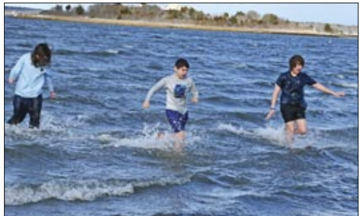
Plungers get in and out of the water quickly on a cold and windy New Year's Day 2026 on West Island's Causeway Road beach for the annual friends and neighbors Polar Plunge. Even the younguns braved the wild sea.