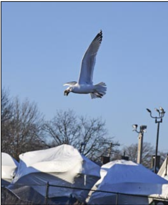
ABOVE: A seagull flies off with a quahog in its beak, looking for a good spot to drop it so it will crack and he can eat it, at the Pease Park boat ramp in Fairhaven on 3/3/25. RIGHT: A few minutes later, he finds his spot, but curiously enough, he did not eat it after dropping it.