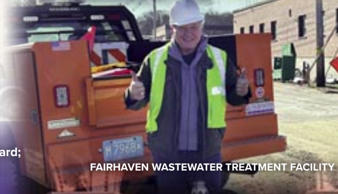
FAIRHAVEN WASTEWATER TREATMENT FACILITY