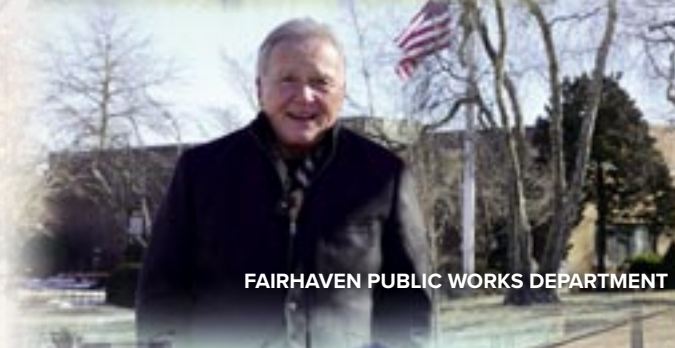
FAIRHAVEN PUBLIC WORKS DEPARTMENT