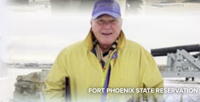
FORT PHOENIX STATE RESERVATION