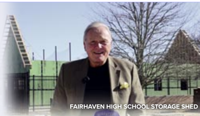
FAIRHAVEN HIGH SCHOOL STORAGE SHED