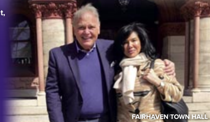
FAIRHAVEN TOWN HALL