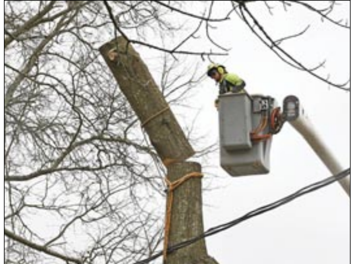
LEFT & MIDDLE: Sawdust flies as a worker from GBK Company cuts into the trunk of a tree on Union Street in Fairhaven on 2/27/25 to make way for electrical upgrades to the Millicent Library. A worker from GBK Company watches as a piece of the trunk topples over.