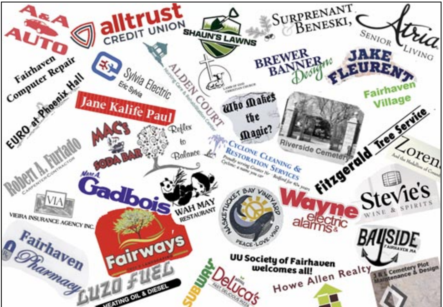
There's no need to shop outside of the Neighb News family of advertisers. See story on page 12.