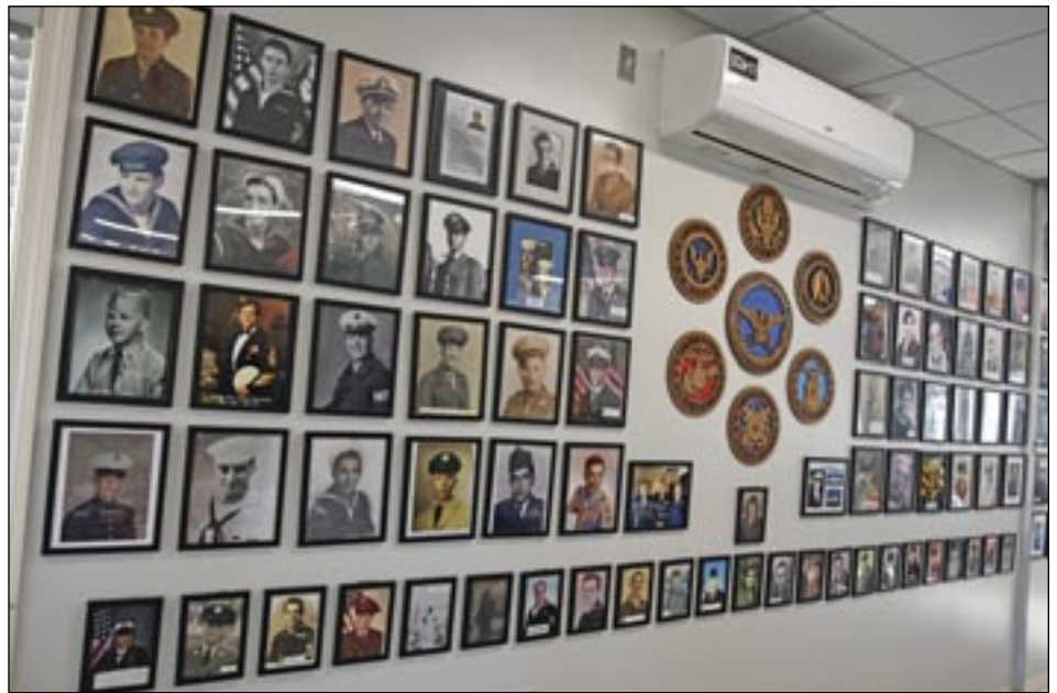
Some of the 143 photos of local veterans on the Wall of Honor at the Fairhaven Senior Center at the annual Veterans Luncheon on 11/12/24, when the wall was rededicated after being refurbished.