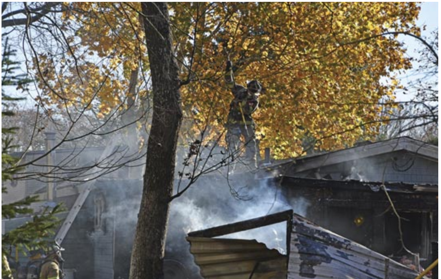
A Fairhaven Firefighter pokes at the roof of 115 Ebony Street in Fairhaven after a fire in an outdoor fire pit got out of control and spread to the house on 11/18/24. See page 13 for story.