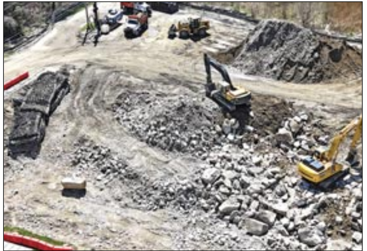
The site of the new Wastewater Treatment Plant in Fairhaven after blasting on 4/22/24, the start of a $70 million upgrade required by the Environmental Protection Agency (EPA), slated to be finished by August of 2026.

If the project stays on track it will be completed by August of 2026.