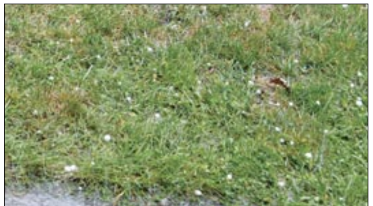
ABOVE: Hail litters a lawn on West Island on Monday, 8/26/24 during a storm that dumped rain and half-inch hail on the island and caused a gust of wind up to 33 MPH.

Video and pictures throughout SE Mass. show hail looking like a snowstorm. The dark clouds could be seen approaching, and there was lots of loud thunder, bright lightning, and wind gusts up to 65 MPH; and a 33 MPH gust recorded by the West Island Weather Station (WestIslandWeather.com). Rain poured in sheets in some places. According to ML Baron of WI Weather, rain was in isolated pockets from .25 inch to .60 at Town Beach. Some areas got 2 inches in 20 minutes. Mattapoissett got 1.79".