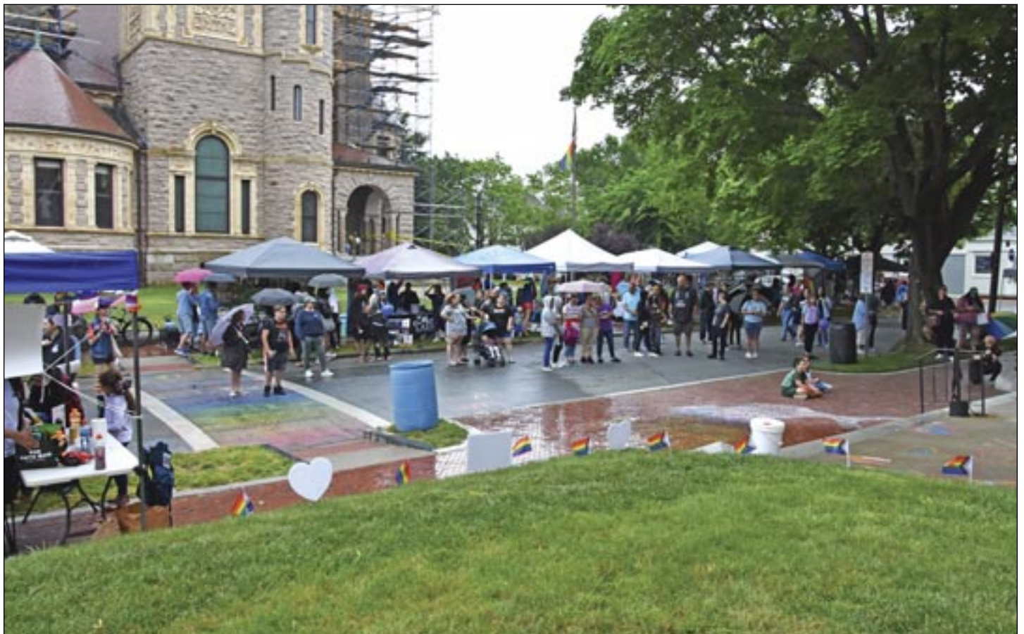
Despite the rain, Center Street in front of Fairhaven town hall is filled with people listening to performers during Fairhaven's Got Pride on Sunday, 6/9/24. See page 16 for story.