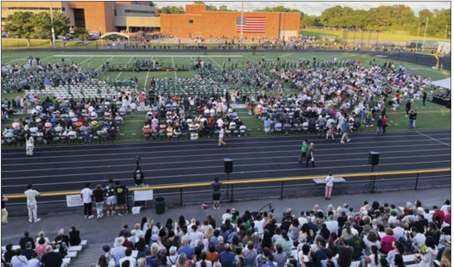
Jeffery E. Riley Stadium at Greater New Bedford Voc-Tech is filled with students, faculty and family members during the graduation ceremony on 6/7/24, when 477 graduated.

The ceremony available on demand on the school's YouTube channel https://www.youtube.com/watch?v=tsS-OIMfh4I