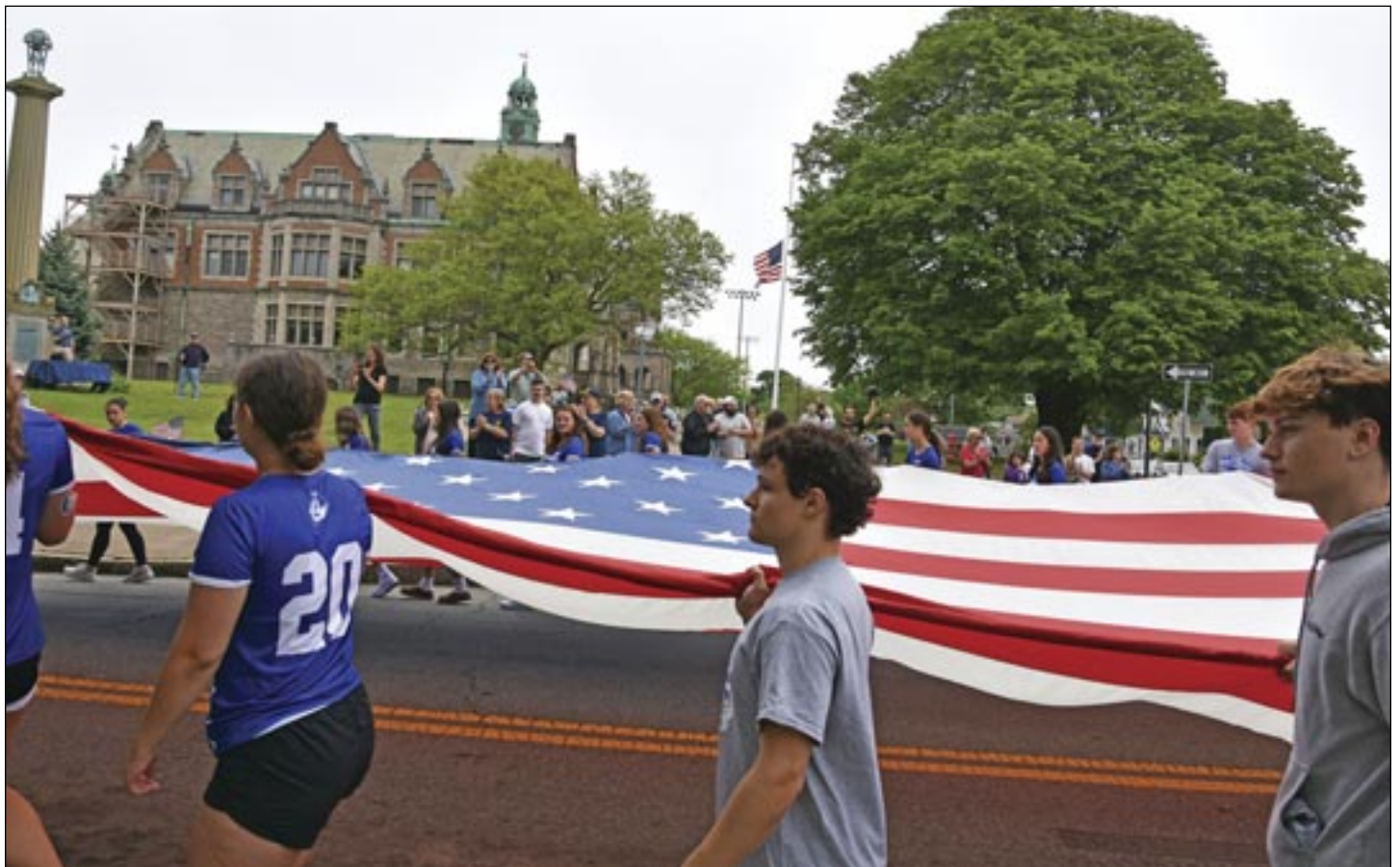
Fairhaven High School students, including members of the championship football team, carry a 30x50-foot American flag by the high school during the Memorial Day Parade on Main Street on 5/26/24. See page 12 for story.