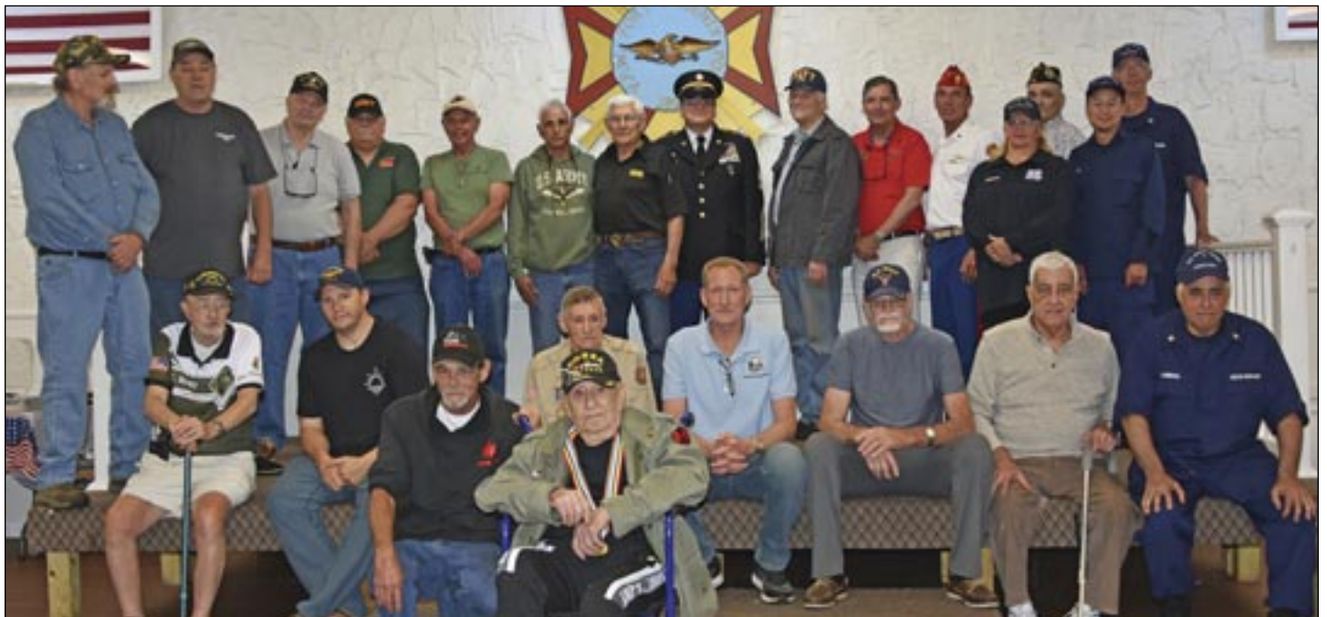
Veterans who gathered at the VFW on Middle Street in Fairhaven pose for a group shot after the Memorial Day Parade and ceremony on 5/26/24.

The parade and ceremony will be available on Fairhaen Community TV at www.FairhavenTV.com