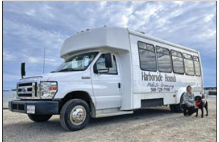
Harborside Hounds, based out of Fairhaven, Mass., provides grooming for dogs at your home in their mobile grooming bus.

Our online booking service is easily accessible, and we are able to accommodate you and your busy schedule. Go to www.harborsidehounds.com and click the "book now" link, visit our Instagram, Facebook, and TikTok pages, @harborsidehounds or you can contact us directly at 508-728-7930.