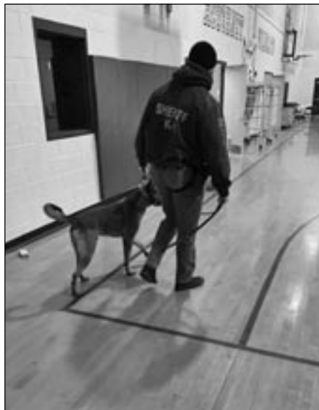
A Bristol County Sheriff's Office K-9 aids in the protective sweep after the Acushnet Public Schools received an anonymous emailed threat on Saturday, 11/25/23.