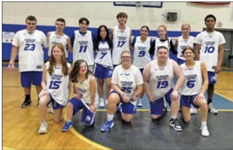
Members of the Fairhaven Unified Basketball Team pose for a photo on their Senior Night, 11/1/23, when they lost to ORR.