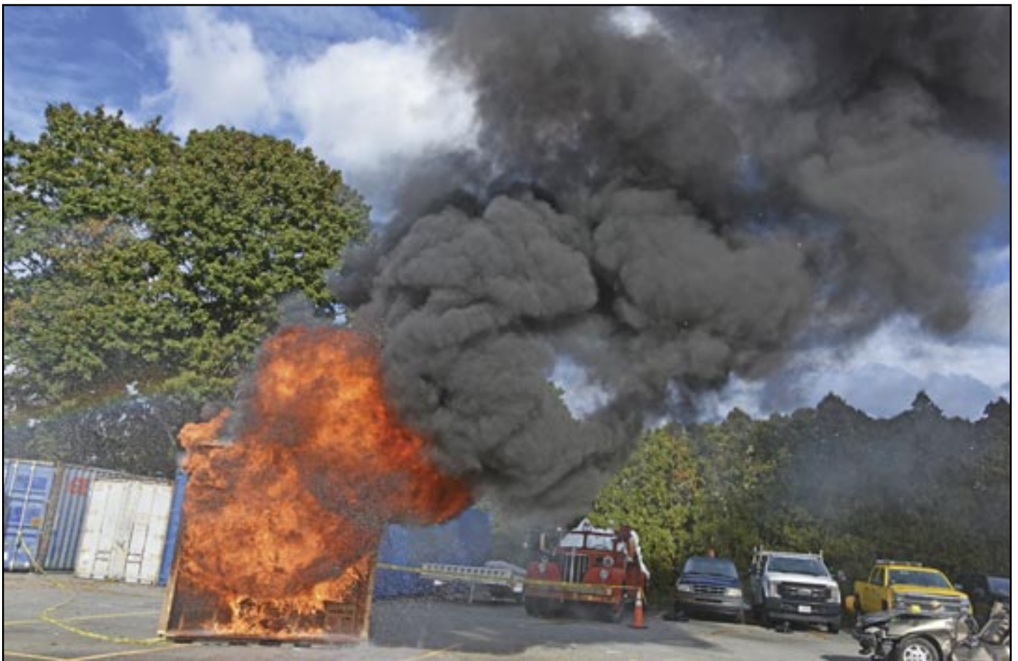
A small building is ablaze to show how quickly fire grows during a demonstration at the Fairhaven Fire Department's Open House on 10/15/23. See page 12.