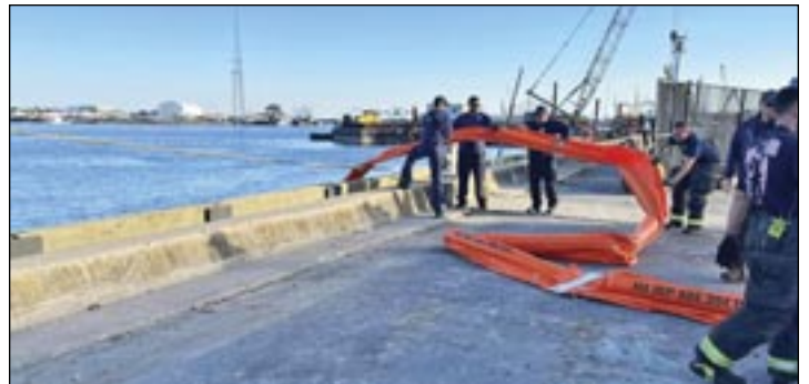
LEFT: A wide gap, empty water, and some unattached pilings are all that remain after a pier collapsed on 10/11/23. RIGHT: Officials from a variety of agencies deploy containment boom to control any fluids and debris that may have gone into the water