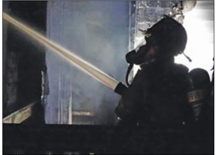
LEFT: Firefighters are on the roof of the house at 41 Adams Street in Fairhaven fighting a heavy fire on 9/29/23 that caused more than $150,000 in damage. RIGHT: A firefighter is silhouetted fighting a fire.