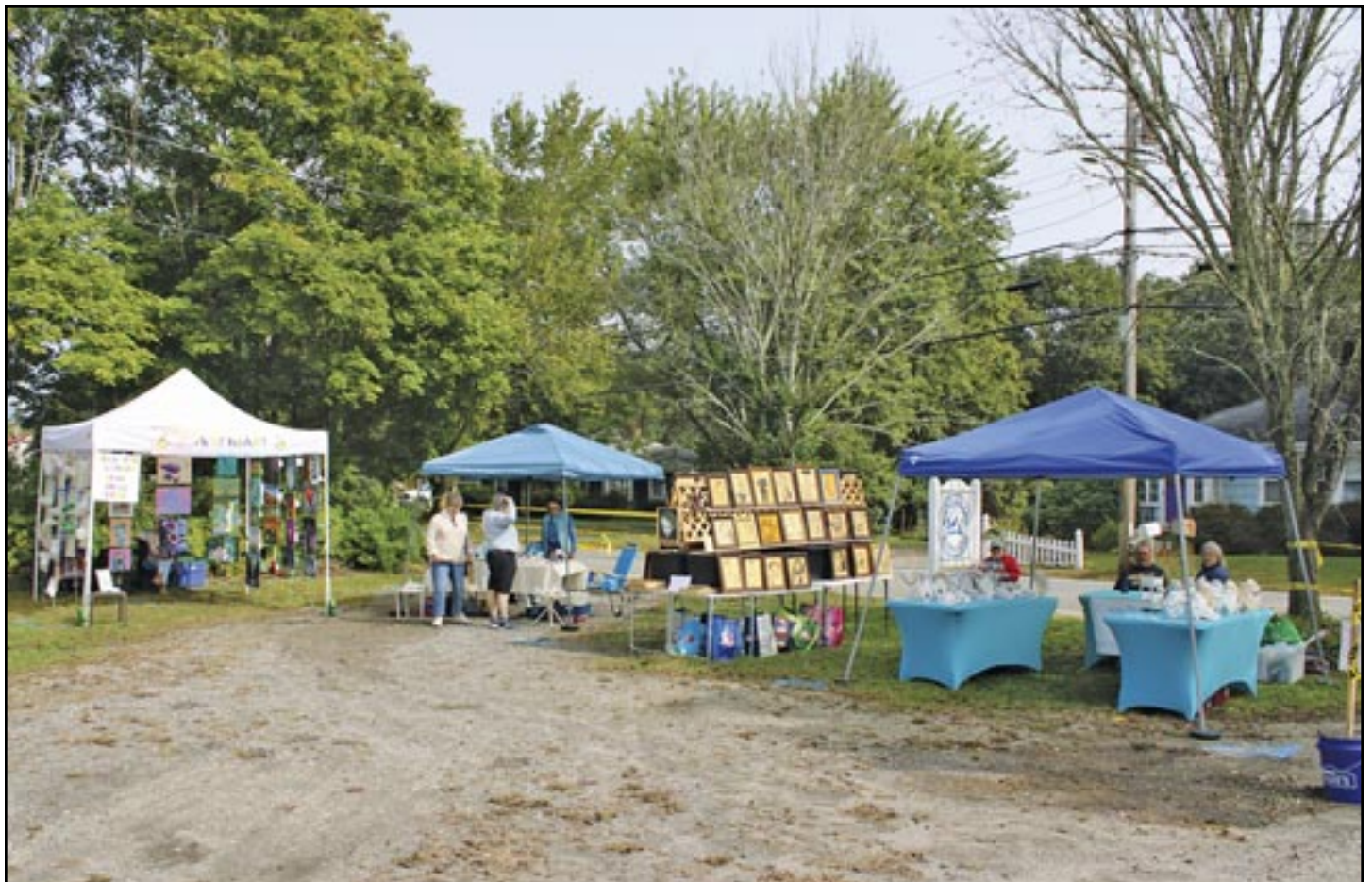
Bright skies greet attendees of the Acushnet Grange Fair on Sunday, 10/1/23, which was postponed from the day before due to rainy weather. See page 12.