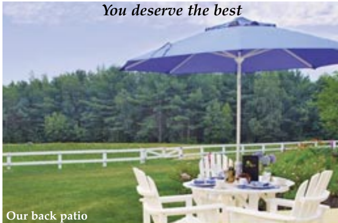
Our back patio

Call today to schedule a visit! Walk-ins welcome