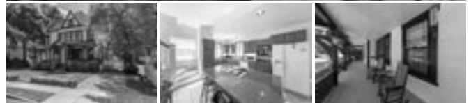
10 HARBOR MIST DRIVE | FAIRHAVEN | $310,000