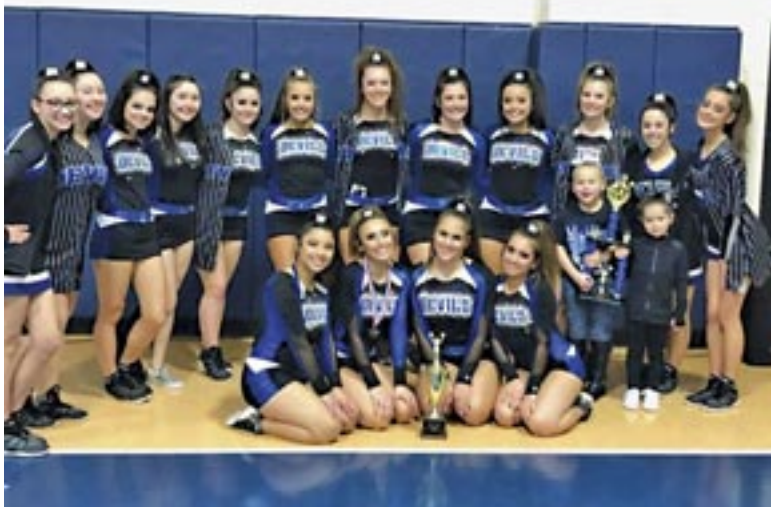
The Fairhaven High School Cheerleaders took first place and were named "Grand Champs" at their South Coast Conference competition, the Tri-County Vocational Invitational in Franklin this weekend, February 9-10, 2019. The team has been winning trophies every year and just seems to get better and better (well, according to the proud parents, anyway). LEFT: The cheerleaders pose with their trophy. RIGHT TOP & BOTTOM: The FHS cheerleaders perform the routines that helped them win.