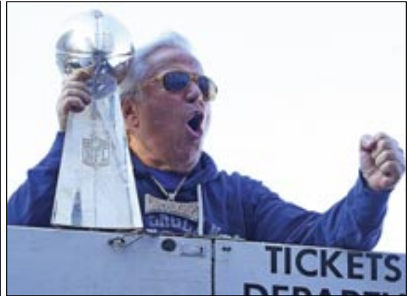
Rob "Gronk" Gronkowski celebrated with teammates and a drink or two during the Patriots Super Bowl parade on 2/5/19 in Boston. He sported many different looks. Here he is in a reflective police vest, along with teammate James White*. ABOVE RIGHT: Patriots owner Robert Kraft holds one of the six Super Bowl trophies and gives a shout to the crowd during the duck boat parade celebration held in Boston on 2/5/2019. (*Fixes error from previous versions, wrong name)