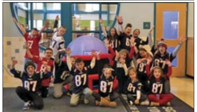
ABOVE: Students at the Wood School in Fairhaven show their support for New England Patriots quarterback Tom Brady, TB12, on Friday 2/1/19, before Sunday's Super Bowl game. ABOVE RIGHT: #11 NEVER gives up! Students (and a couple of adults) show their support for Julian Edelman. BELOW RIGHT: Students show their support for Rob "Gronk" Gronkowski.