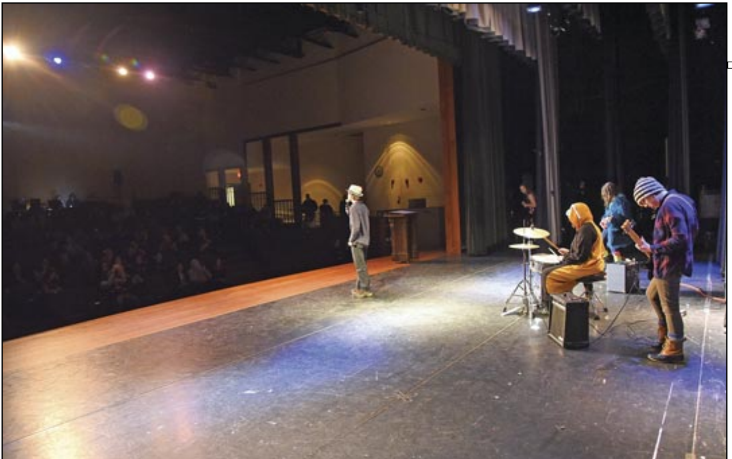
"The Rats" perform "Stacy's Mom" by Fountains of Wayne to a packed house at the 2019 Fairhaven High's Got Talent show held on 2/1/19 in the FHS Performing Arts Center. See page 12.