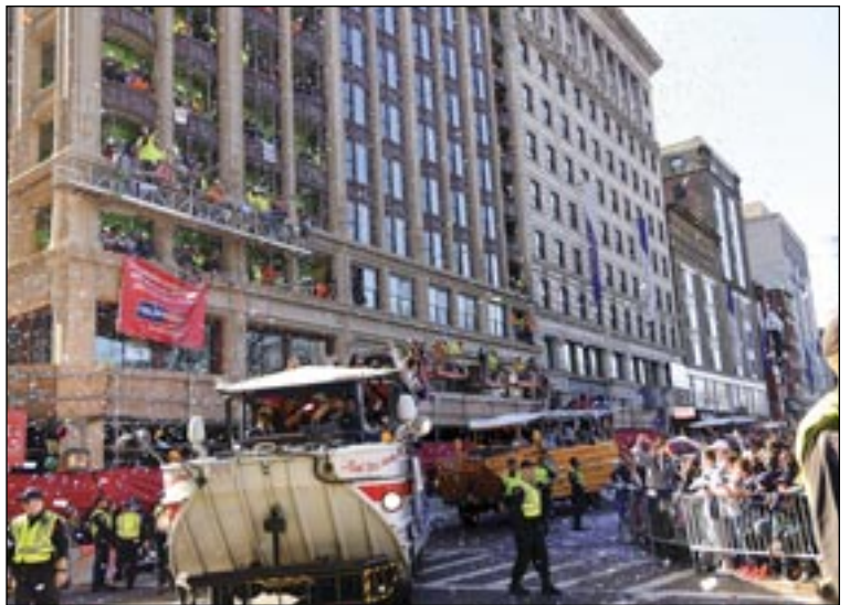
ABOVE: The air is filled with confetti, the side of the building is filled with construction workers, the windows and balconies are filled with fans, and the sidewalks are jam packed with fans as the duck boats turn the corner from Boylston Street onto Tremont Street during the Patriots Super Bowl parade on 2/5/19 in Boston. LEFT: Tom Brady waves to the crowd. BELOW RIGHT: Fans made giant paper airplanes and flew them across the street while waiting for the parade.

On the very first duck boat was Robert Kraft the owner of the