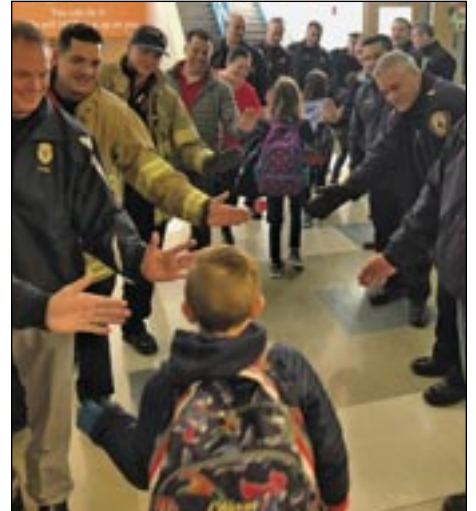
Members of the community create a Kindness Tunnel to greet children at the East Fairhaven school on 1/31/19 (LEFT) and at the Wood School (ABOVE) as part of The Great Kindness Challenge.