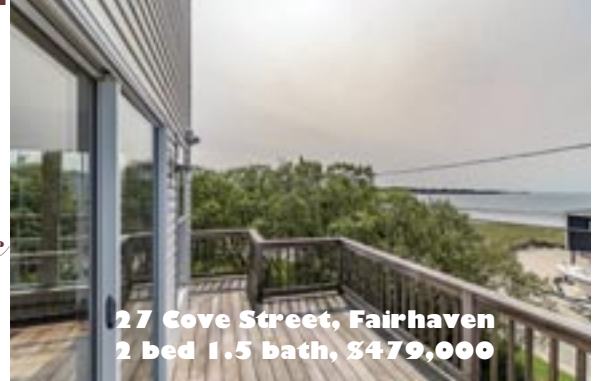
27 Cove Street, Fairhaven 2 bed 1.5 bath, $479,000