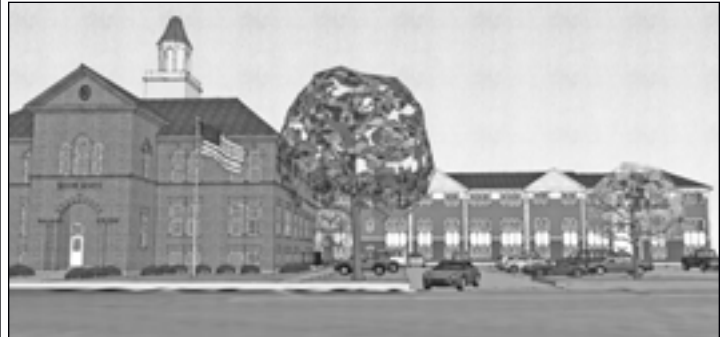
TOP: The Oxford School Residences in an artist's rendering as seen from the Livesey Park side of the building. The complex will consist of 63 units, 46 one-bedroom and 17 two-bedroom, for a total of 80 bedrooms for tenants 62+ years of age. The proposal has sparked controversy in the town. ABOVE: The view from Main Street. Image provided.