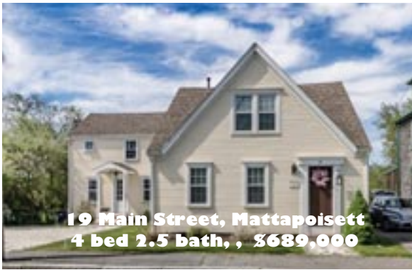
19 Main Street, Mattapoisett 4 bed 2.5 bath, , $689,000