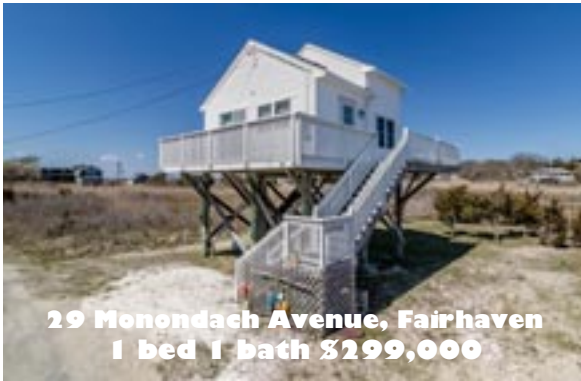
29 Monondach Avenue, Fairhaven 1 bed 1 bath $299,000