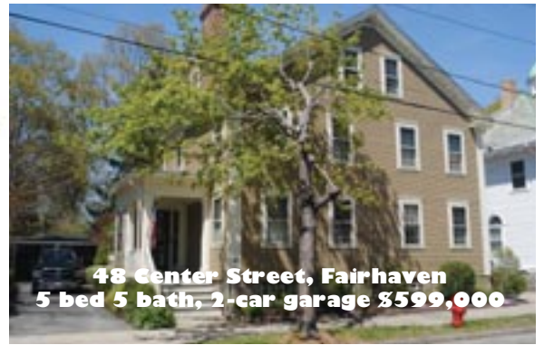
48 Center Street, Fairhaven 5 bed 5 bath, 2-car garage $599,000